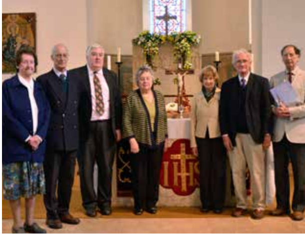
Members of the Brixworth Archaeological Research Committee at the launch of the book in Brixworth Church