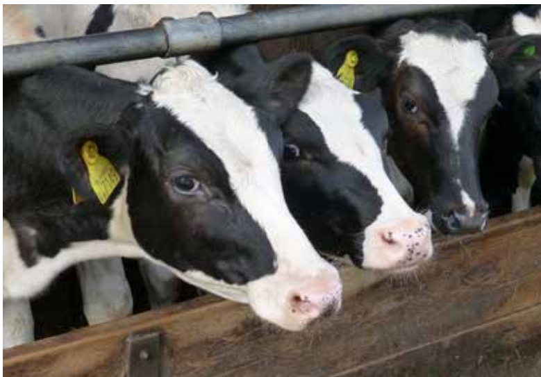
Livestock has largely disappeared, but a few sheep and cows remain

Indeed, while we have been enjoying much better weather this summer, our local farmers are still suffering from the consequences of last year's difficult autumn and hard winter, which produced a lot of slugs and waterlogging. Ten percent of this year's crop had to be