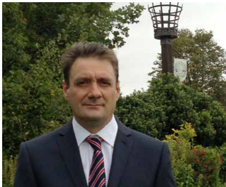
Cllr Pointer is incensed that leaked information was discussed on Twitter

A new solution was sought. In July the Parish Council agreed to seek funding for a new iPad from the government's Access to Work scheme and split the difference with Daventry District Council. This time the iPad would be owned by Daventry, and its use subject to DDC's policies.