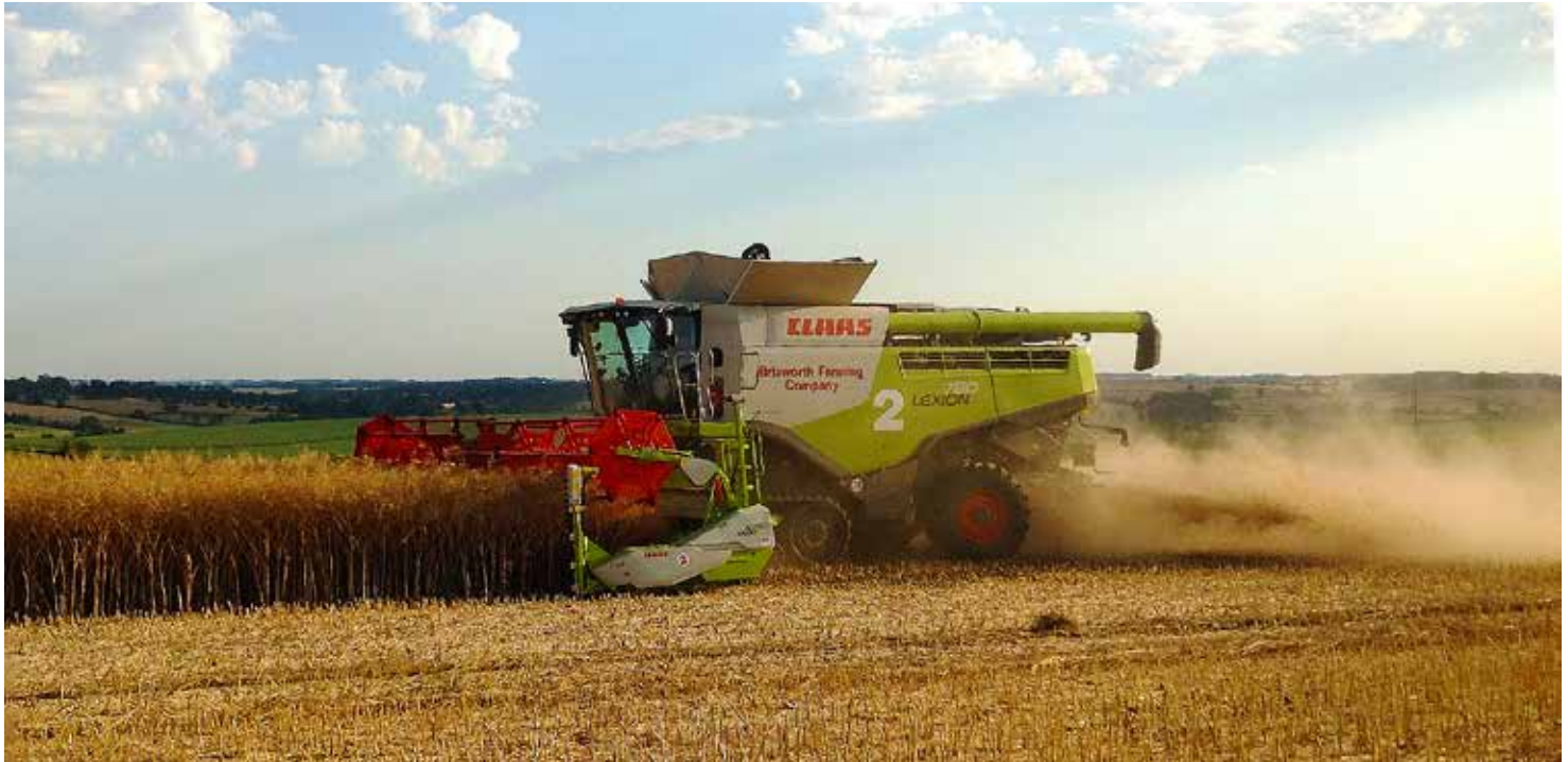
Technology has changed farming beyond recognition: harvesting today (top) and just a generation ago (bottom)

One of the aspects most of us appreciate about living in and around Brixworth is our ease of access to some beautiful countryside. Yet most of us know very little about what goes on there. You may be surprised to find out!